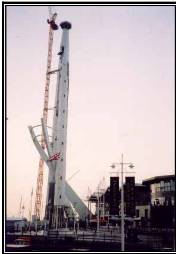
Photo 18: Gunwharf Quays, Construction of the New Observation Tower