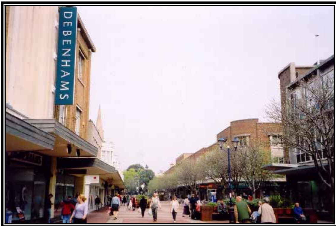
Photos 19 and 20: Southsea Town Centre, Showing Debenhams and Knight and Lee (John Lewis) Department Stores