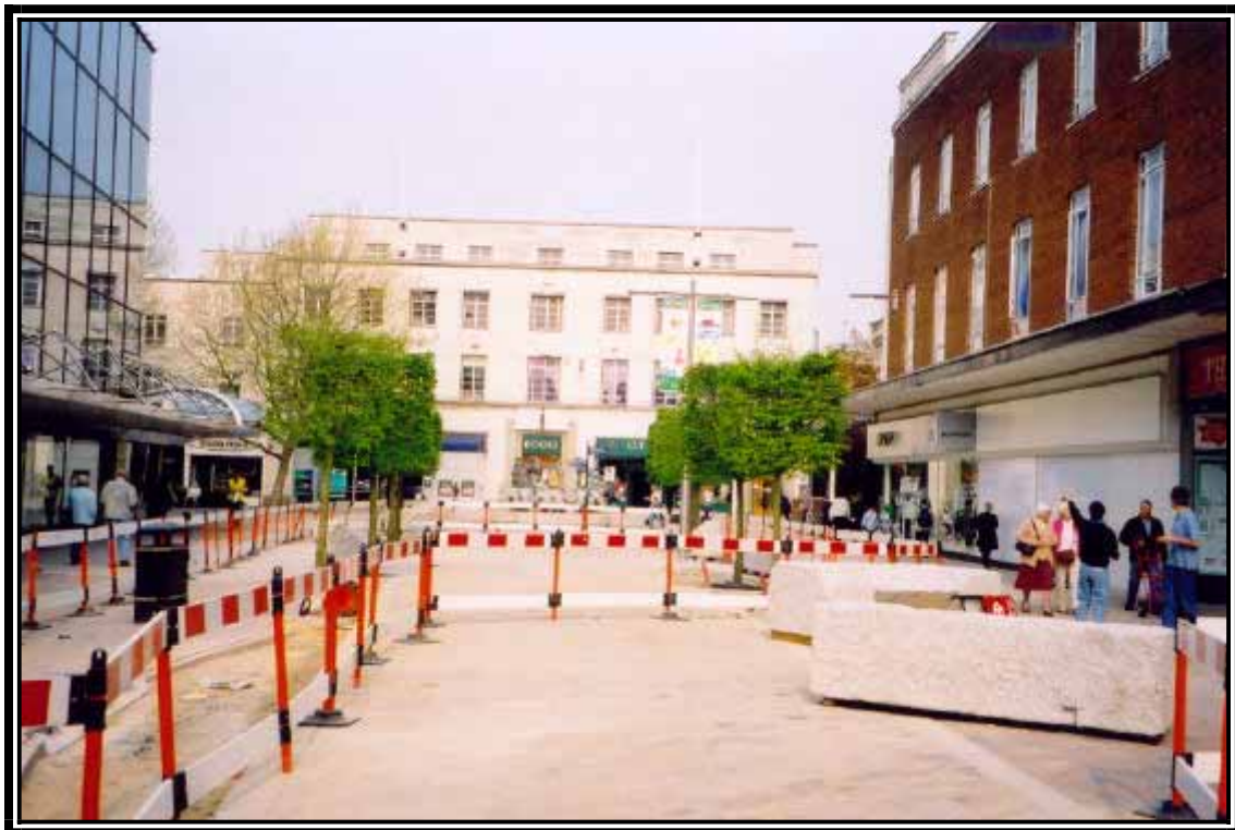
Photo 4: Portsmouth City Centre: Landscaping Improvements in Arundel Street