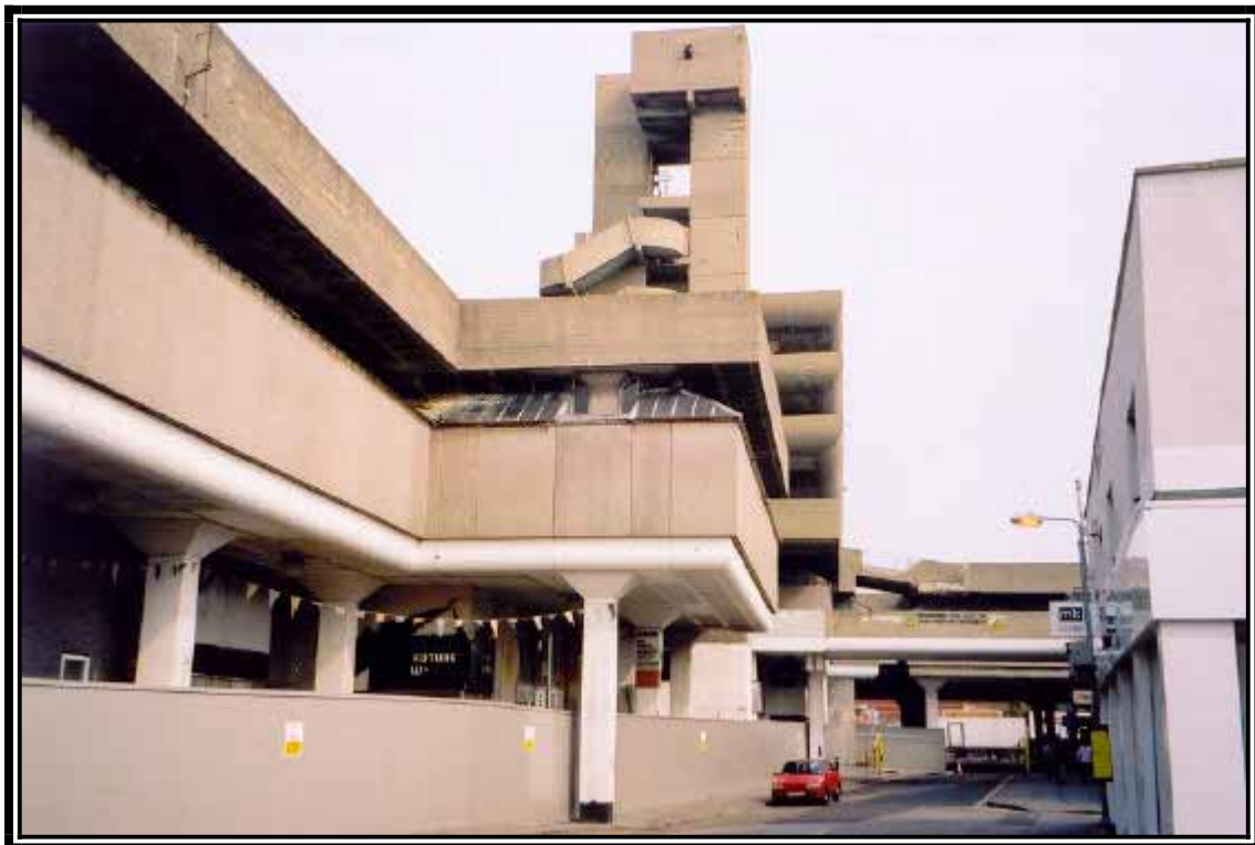
Photos 5 and 6: The Tricorn Centre: Awaiting Demolition and Comprehensive Redevelopment