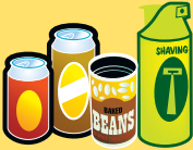
Cans and aerosols

Please put the following items in your recycling bin – clean, dry and loose: