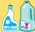
Plastic bottles (no lids)