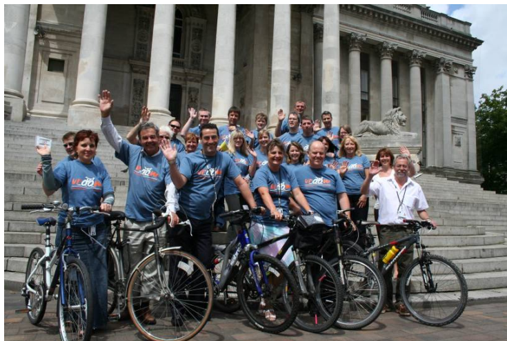
Top: Queuing for Dr Bike, cycle security marking